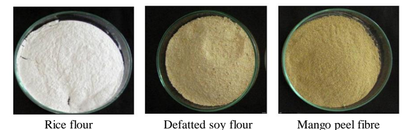
Figure 1 Raw materials used in the extrusion

The total phenolic compounds (TPC) of MPF were determined using the Folin-Ciocalteu method (Singleton, Orthoter, & Lamuela-Raventes, 1999) with some modification. The TPC concentration in the sample was expressed as mg of gallic acid equivalents (GAE) per 1 g of sample. The antioxidant activity of the methanol extract of the samples was determined by free radical scavenging activity by using 2,2-diphenyl-1-picrylhydrazyl (DPPH) following the method of Brand-Williams, Curvelier, and Berset (1995). The percentage of free radical scavenging activity was plotted against the amount of sample and the half-inhibition concentration (IC_{50}) was determined.